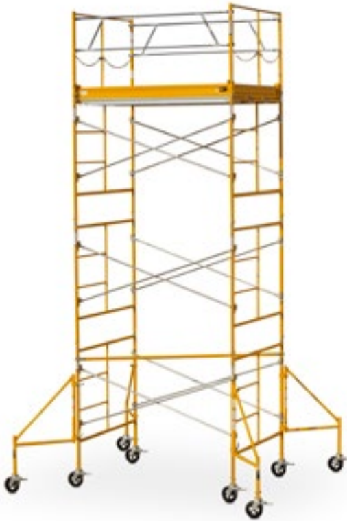
15' Rolling Tower