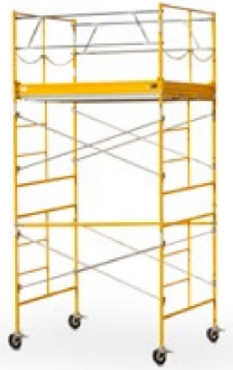
10' Rolling Tower