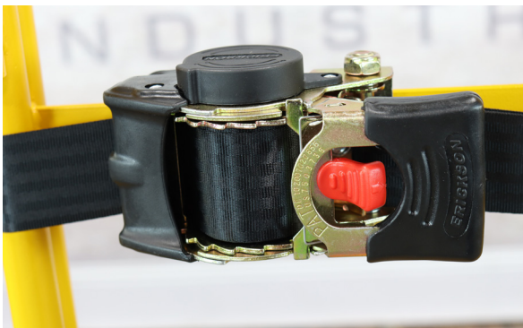
10' Auto retracting ratchet strap