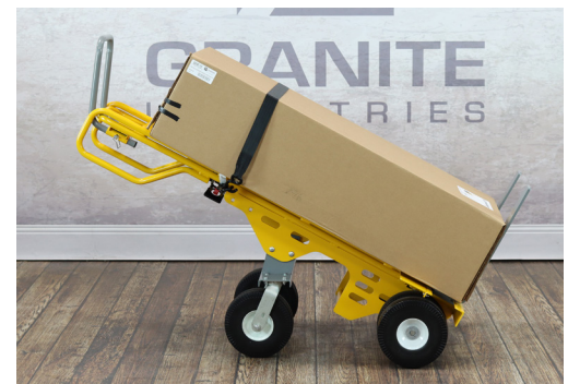
Shown in standard rear wheel position