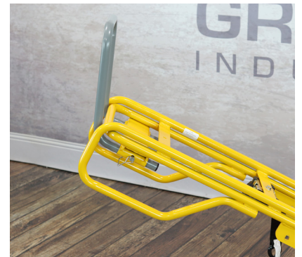
Handle in standard position