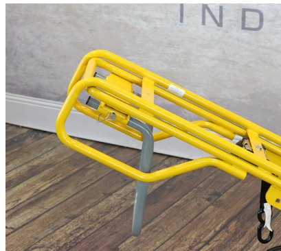
Handle in down position