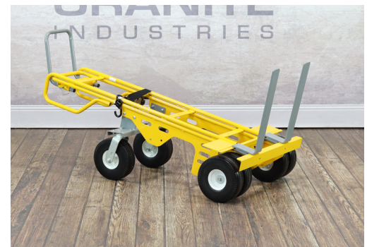
Shown in low rear wheel position