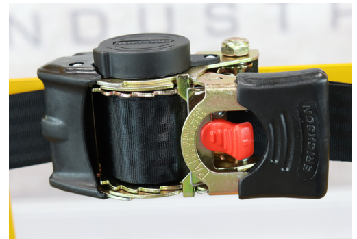
10' Auto retracting ratchet strap