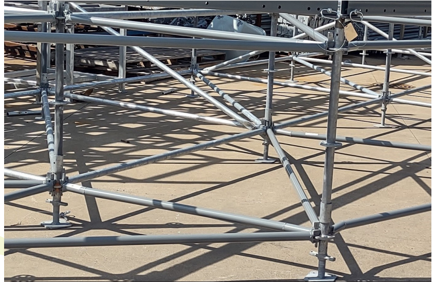
Substructure for Epic Round