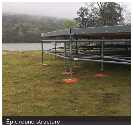
Epic round structure