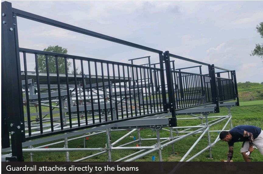
Guardrail attaches directly to the beams