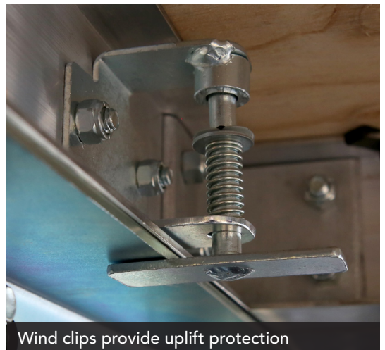
Wind clips provide uplift protection

EPIC is professionally designed and engineered and conforms to necessary code compliance. Patents Pending.