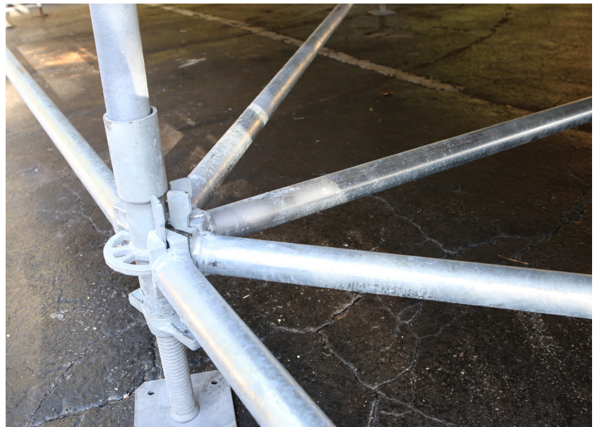
Diagonal braces ensure the substructure is square.