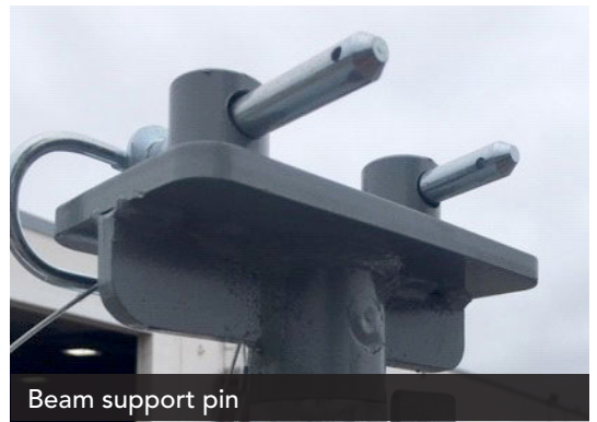
Beam support pin

The flooring system ties into the substructure further improving the safety of the tent install. Compatible with multiple decking options including beam and plywood as well as a variety of manufactured cassette decks.