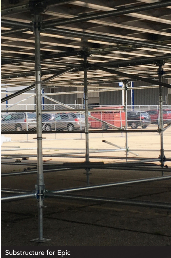
Substructure for Epic