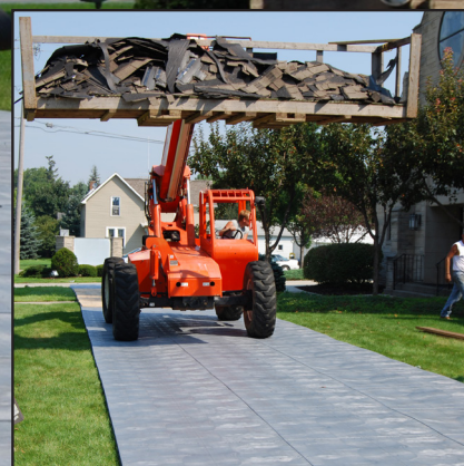
Shown with Sky Trak 6042 Weights 25,100 lbs (plus load)